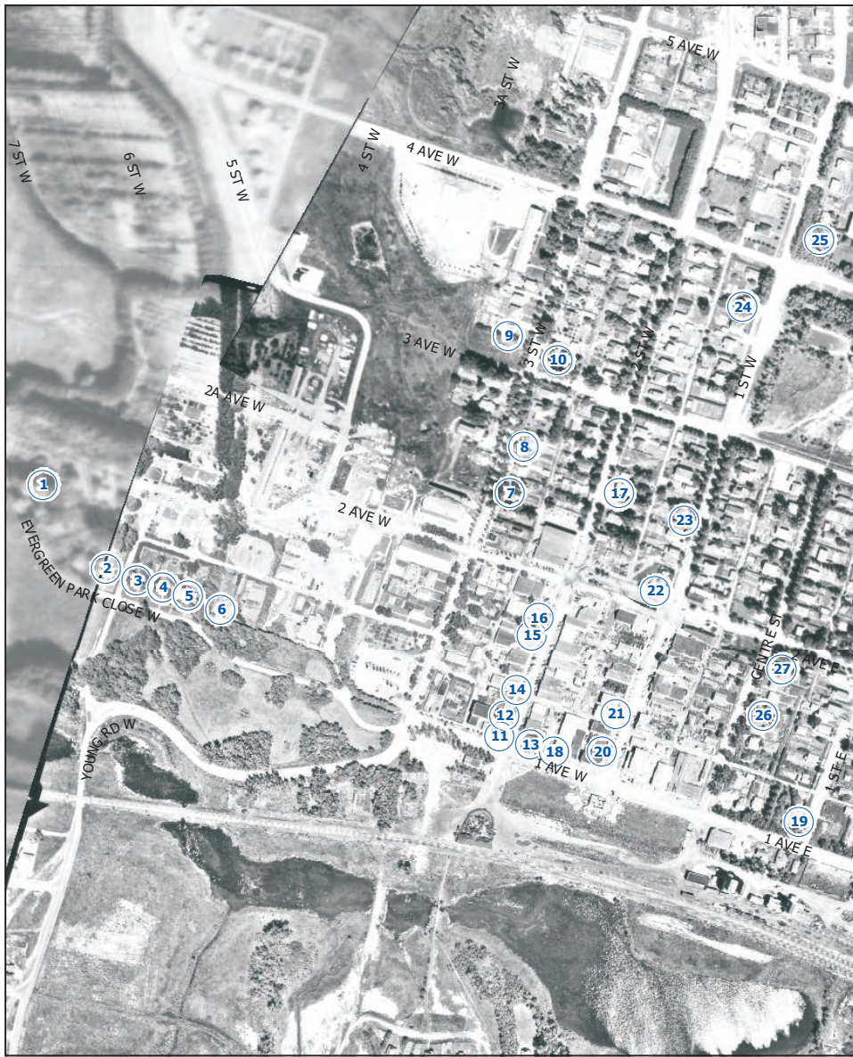
Air Photos from 1951 & 1952